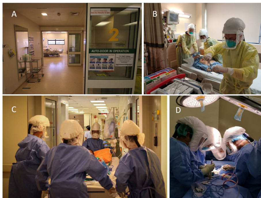
Fig. 1 Infection control and prevention. a Negative pressure airborne infection isolation rooms (AIIRs) used for our isolation ICUs. b Cardiac arrest simulation training with disposable caps, gloves, and fluid-resistant gowns, eye protection along with respiratory protection using a fit-tested National Institute of Occupational Safety and Health (NIOSH) certified disposable N95 filtering facepiece respirator and powered air-purifying respirators (PAPRs). c Transport checklists and protocols (movement plans) were determined and rehearsed before actual implementation. d Operative procedures performed with PAPR in preparation for the COVID-19 pandemic

At the extreme end of the surge continuum, 'emergency mass critical care practices' will have to be instituted which may come at a cost of suboptimal standards